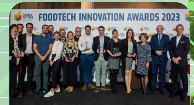
FOODTECH INNOVATION AWARDS 2024