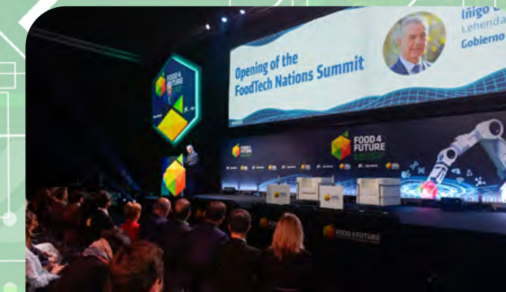
FOOD 4 FUTURE WORLD SUMMIT